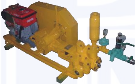
PMG - 5A Fitted with Diesel Engine