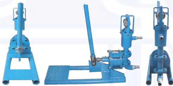
Model HP – 8 Hand Pump – Single Cylinder