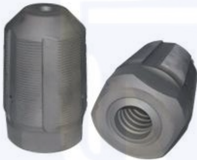
Recovery Tap Male NW Casing / HW Casing

Casing taps/core barrel taps are used to recover casing tubes/ core barrels which have been left in the bored hole. The tap is screwed into the tube/core barrel and then pulled up. The thread screw is a right screw.