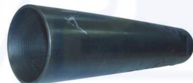
Recovery Tap Female – AW/BW Rod