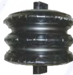
Triple Disc Center Cutter 158 mm Tungsten Carbide Insert (TCI) Version