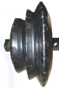
Triple Disc Gauge Cutter 220/148 mm Tungsten carbide Insert (TCI) Version