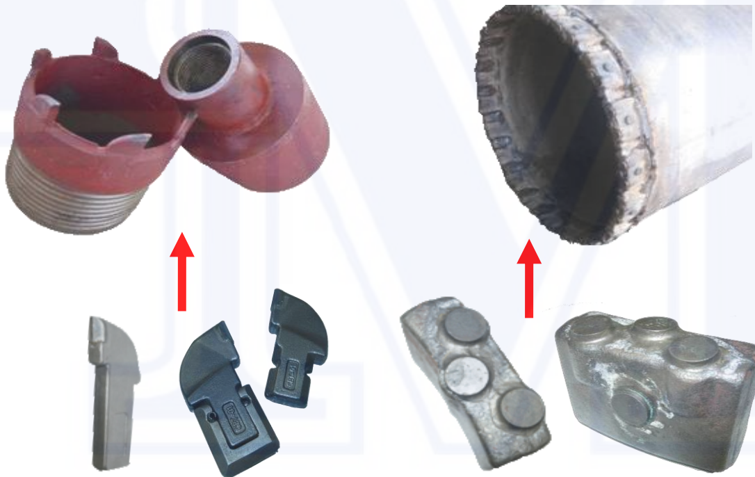
Misc Flat Cutter Short with Holder